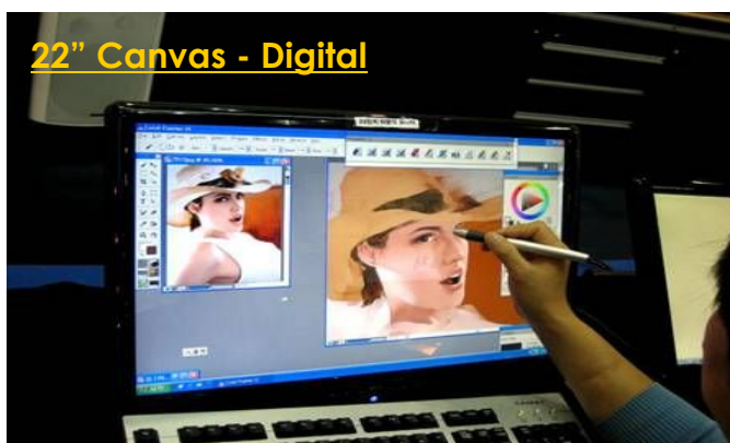
22" Canvas - Digital

"Eduplus" to paint, draw, sketch, sign, mark-up, presentation, write freehand e-mail, save, command the computer by pen flipping. Simple and easy to use as customized to AHA tablet.