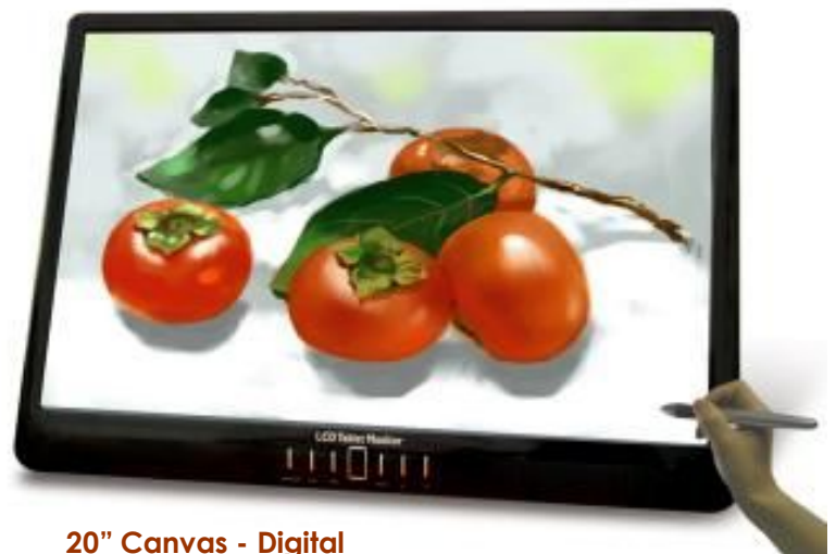
20" Canvas - Digital

All tools for any type of class support free and flexible lecture, clean and clear writing & drawing like a real pen & brush