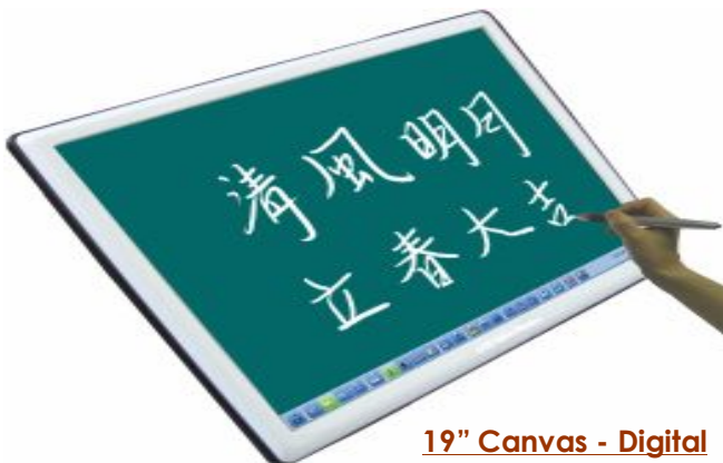
19" Canvas - Digital