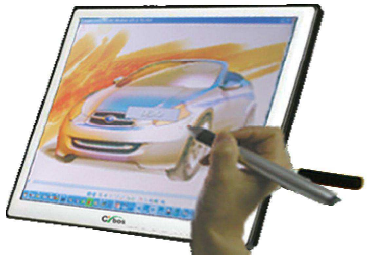
19” Canvas - Digital

All tools for any type of class support free and flexible lecture, clean and clear writing & drawing like a real pen & brush