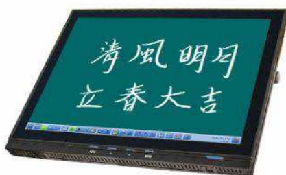
15” Canvas - Digital